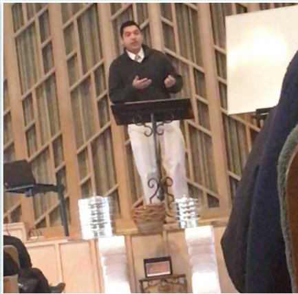
Giving the introduction to our new Sunday evening series "Congregational Growth"