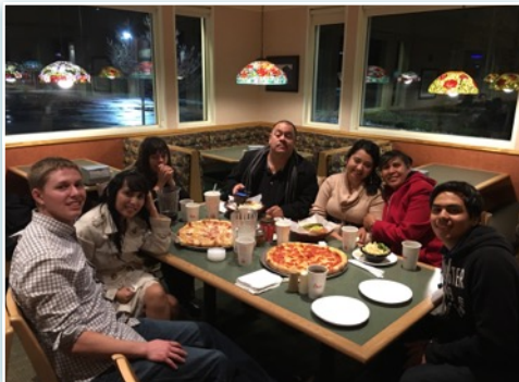
Fellowshipping with the brothers in New Mexico after a Gospel Meeting