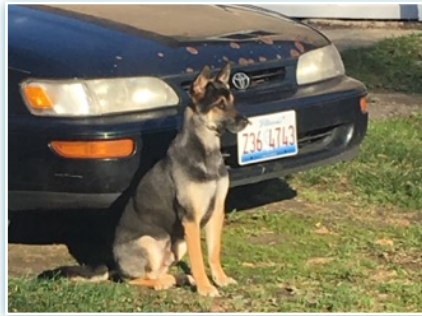
Bear waiting for squirrels or winter...