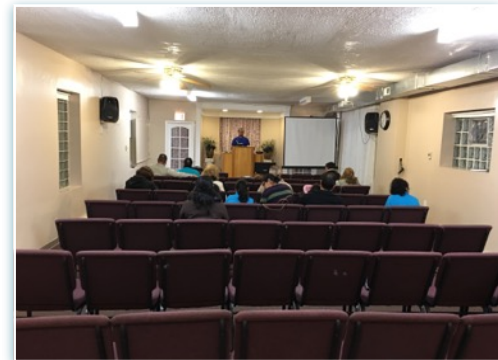
Sunday Worship (Chicago)