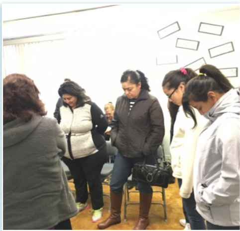
The sisters spending time to have prayer.