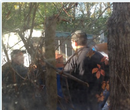
Finding ways to meet new people. Dumpster diving anyone?