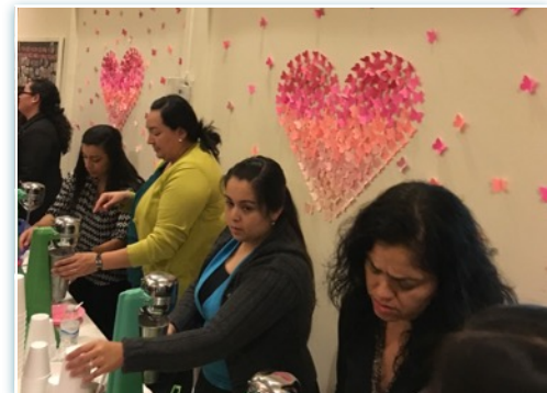
Having a delicious snack and shakes after Monday Service in Elgin.