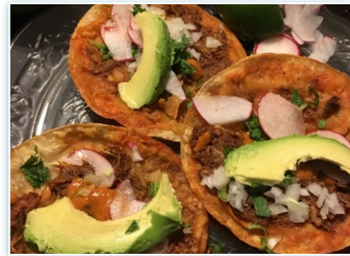
One of the great things about Chicago is that you can have the best of both worlds!