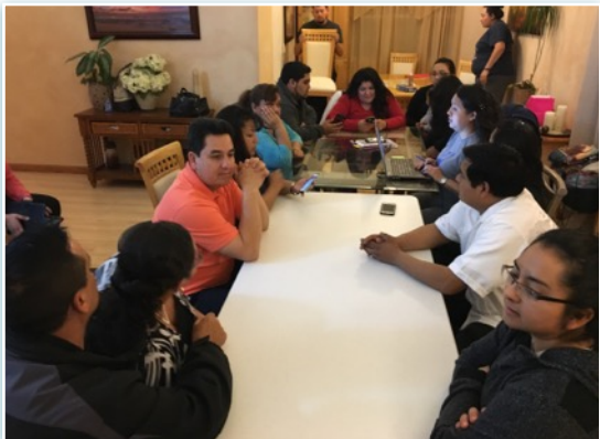
Helping coordinate how we as a church can help a sister who is going through Cancer treatments.