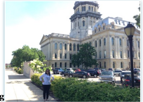
Visiting the Springhill, IL on our way to Chicago!