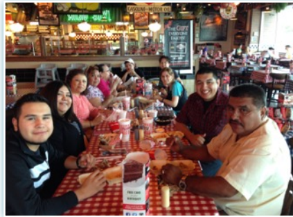
Hosting & spending time with some families that were traveling