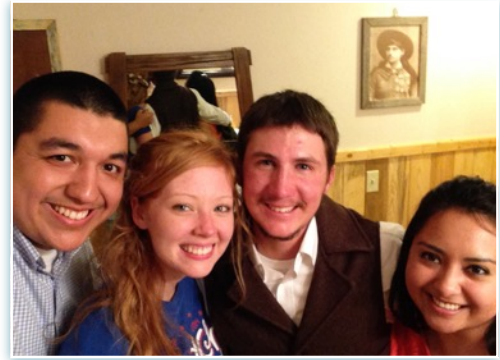
With the Newly Married Couple! Love them very much!