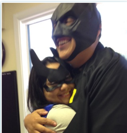
My Partner in Crime!