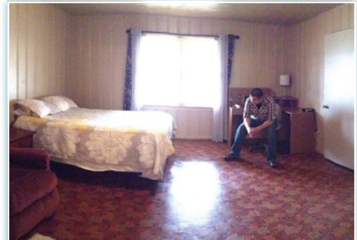
Last day in Lubbock, TX