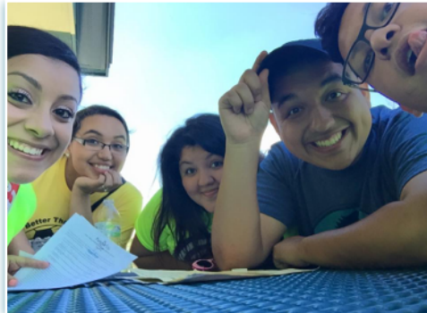
After a hard days work!