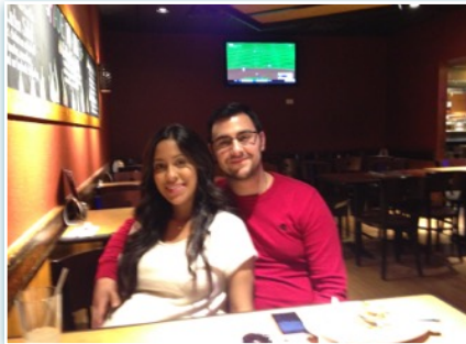
Following and Catching up! Great potential in this couple!